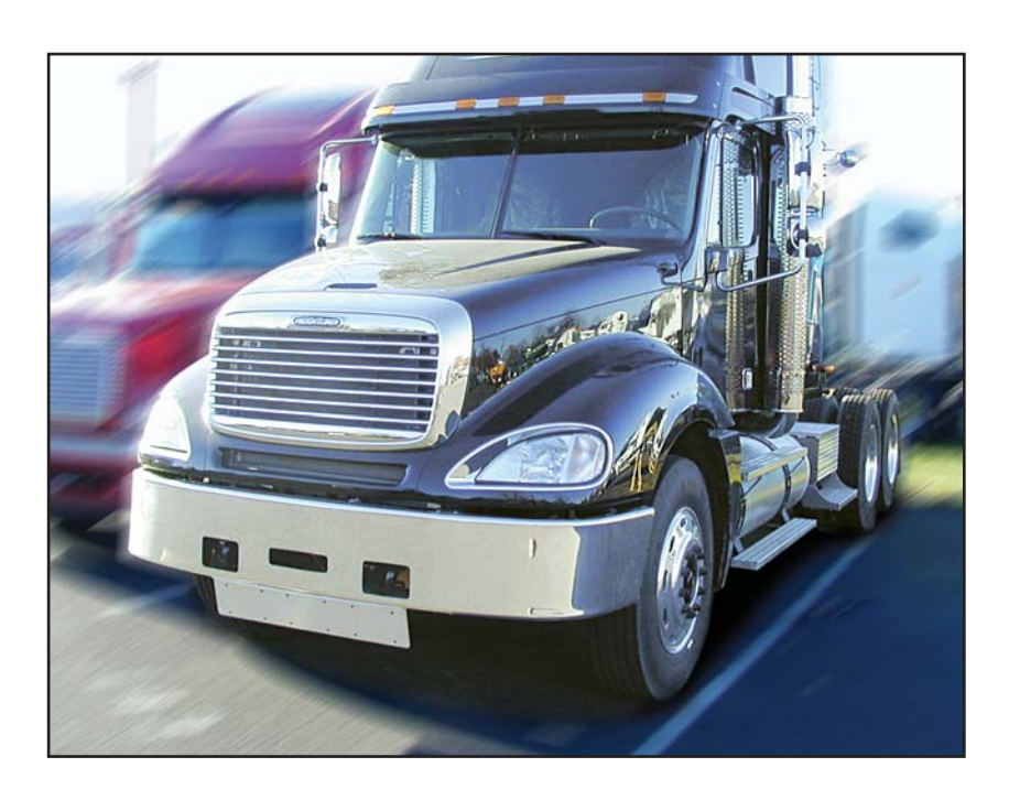
AERO CLAD® is also available for Freightliner Columbia Part Number 0293SSC