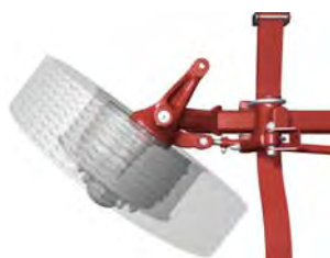
Optimized steering system — 55-degree wheel cut