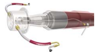
TIREMAAX® tire inflation system

*Contact your local Hendrickson representative for complete warranty terms, conditions and limitations