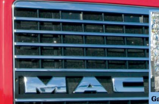
Garbage In, Good