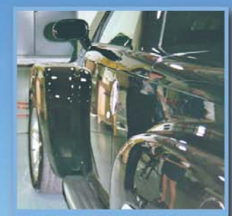
Thermoforming Goes Paint-Free, Too p. 52