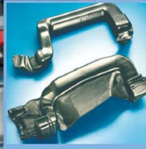
Time Is Right for 3D Blow Molding p. 29