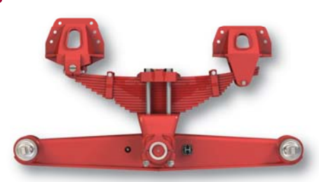
RT Suspension Profile